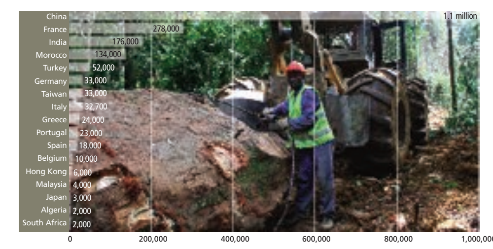
TOTAL 1.9 million cubic metres